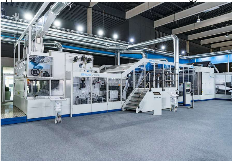
Dilo needling line

DiloGroup would like to discuss the above mentioned developments of needling technology as well as modules of Industry 4.0 applications for further digitalization during the Techtextil exhibition. We will, of course, also inform about the numerous universal and special applications of the complete nonwovens technology.